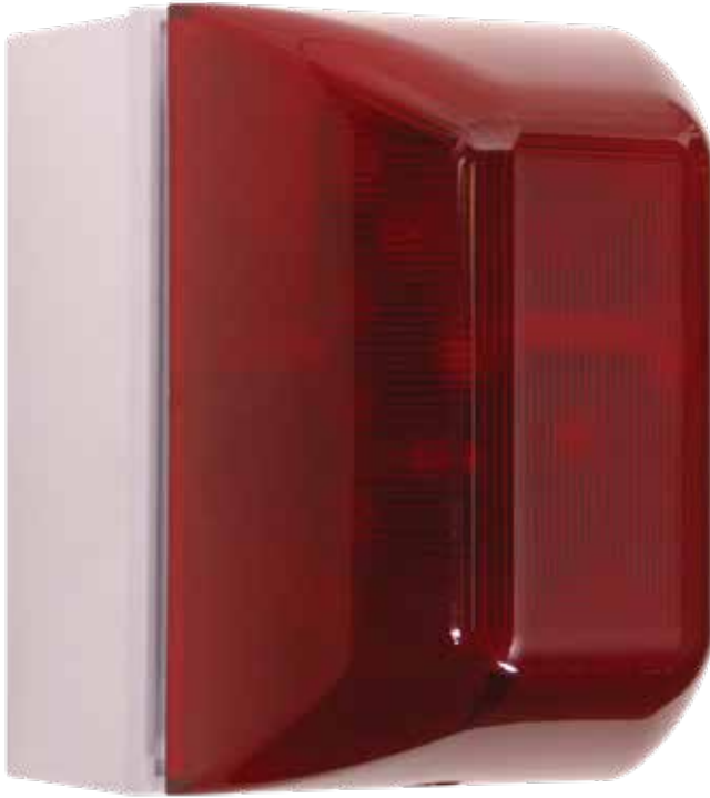
STI-SA5000-R and KIT-71100A-W