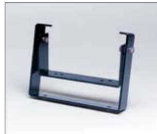
Self-leveling bracket, 210880-01