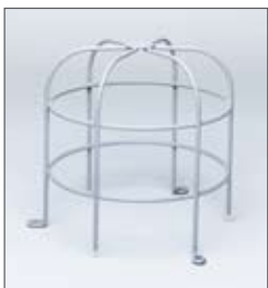
Branch guard, 447303