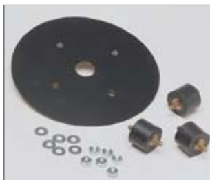
Vibration mount kit, 447302